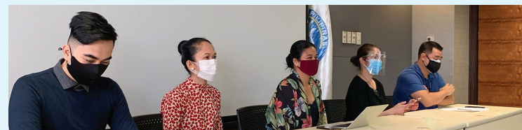
The training sessions were conducted by officers of BSP's Center for Learning and Inclusion Advocacy.

The training is part of the partners' concerted efforts to help the armed forces, civil servants, and BFP and police personnel achieve financial independence. It is in line with BDO Foundation's financial inclusion advocacy and BSP's National Strategy for Financial Inclusion.