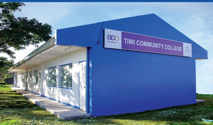
The school building in Tiwi Community College in Albay was one of several structures that underwent maintenance work.