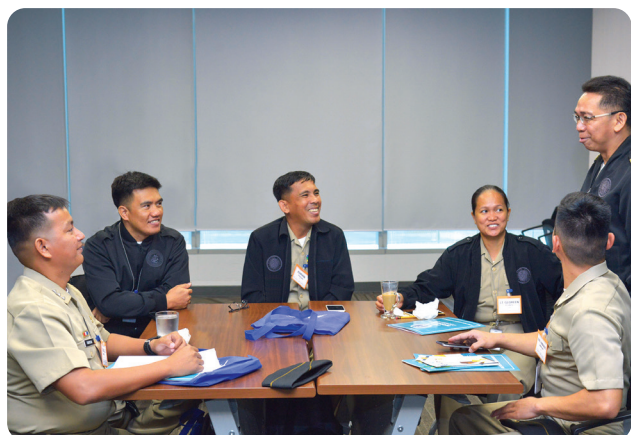
CONDUCTING ONLINE FINANCIAL LITERACY TRAINING SESSIONS