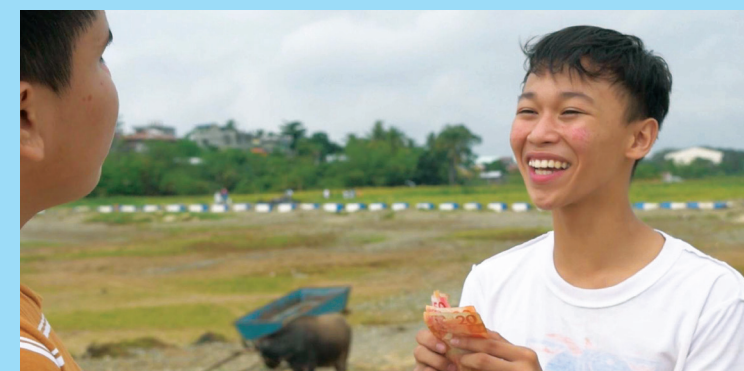
The financial literacy video produced by students of General Santos City Sped Integrated School was declared the 1st place national winner.

BDO Foundation's sponsorship of Sineliksik 2020 resulted in the development of more than 60 learner-generated videos. The foundation sponsored the medals and cash incentives the students received as well as the laptops and LCD projectors awarded to the winning schools.