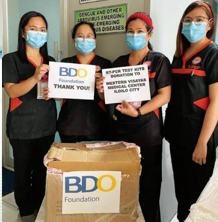
Western Visayas Medical Center and RITM staff welcome the arrival of test kits at the hospitals.

The initiative also covered the two-storey, four-classroom school buildings BDO Foundation has constructed in Ampayon Central Elementary School in Agusan del Norte; Pasonanca National High School in Zamboanga City; Pis-anan National High School in Antique; and Tiwi Community College in Albay.