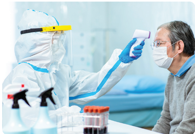
HELPING COMMUNITIES COPE WITH COVID-19