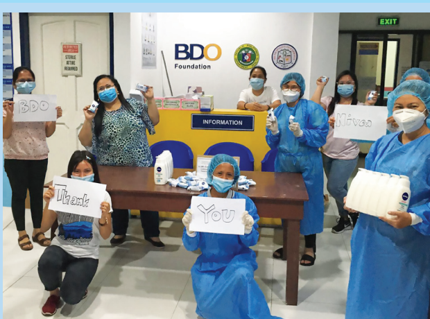
Frontliners of Zarraga Rural Health and Birthing Center in Iloilo welcome the arrival of the products.