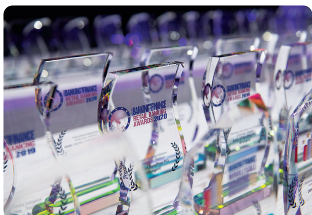
CELEBRATING THE ACHIEVEMENTS OF THE FINANCIAL EDUCATION PROGRAM FOR OFWS