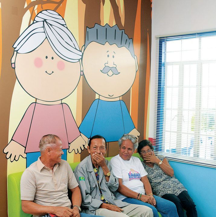
Waiting lounge for senior citizens in Cauayan City Health Office I in Isabela