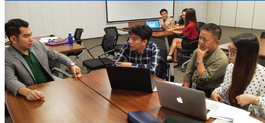
DepEd officers discussed recent inroads made by the financial education program for public schools.