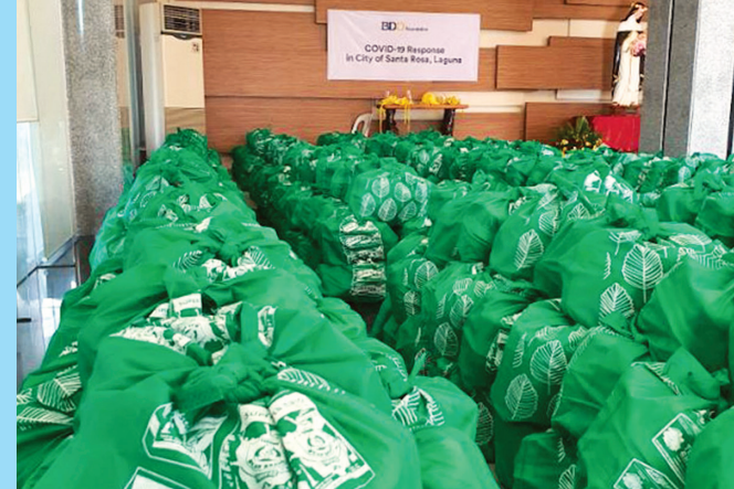
Food packs ready for distribution to residents of Santa Rosa, Laguna